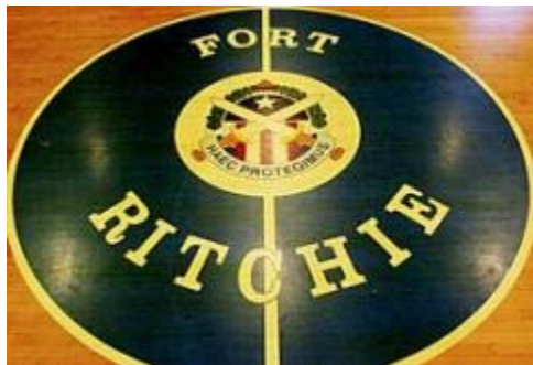
The basketball court is part of the athletic and community building at the former Fort Ritchie.