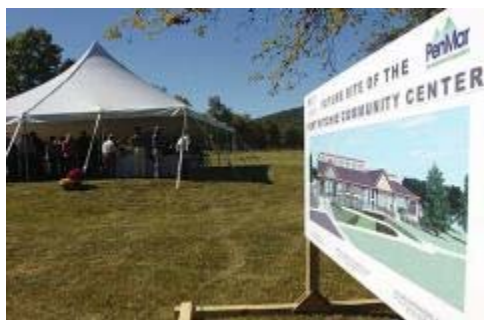
At the groundbreaking ceremony for new development at the former Fort Ritchie.

The Herald-Mail ONLINE http://www.herald-mail.com/